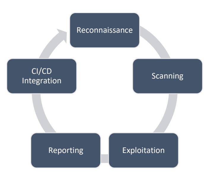
Figure 3: Working of Automated Penetration Testing

Automated penetration testing involves using specialized software tools and frameworks designed to simulate cyberattacks on a network, system, or application. The goal is to identify and exploit vulnerabilities in a controlled manner, allowing organizations to address these issues before malicious actors can exploit them. The process typically follows a structured workflow that includes several key phases (Barker & Jones, 2020):