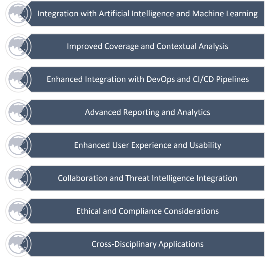
Figure 2: Future Scope of Automated Penetration Testing